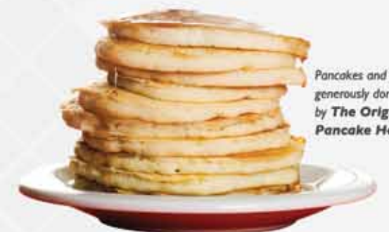
Pancakes and Bacon generously donated by The Original Pancake House

$45 THOUSAND! Raised for Cornerstone Youth Ministries